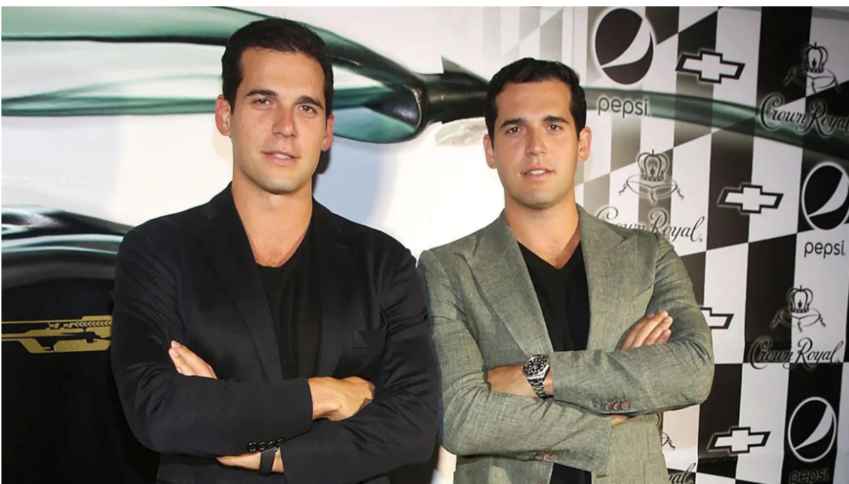
Alexander brothers' alleged victims recount terrifying attacks in impact statements

Prosecutors released footage this week of alleged victims detailing their claims of sexual assault by the Alexander brothers, accused of drugging and then sexually assaulting and raping dozens of women across multiple states.